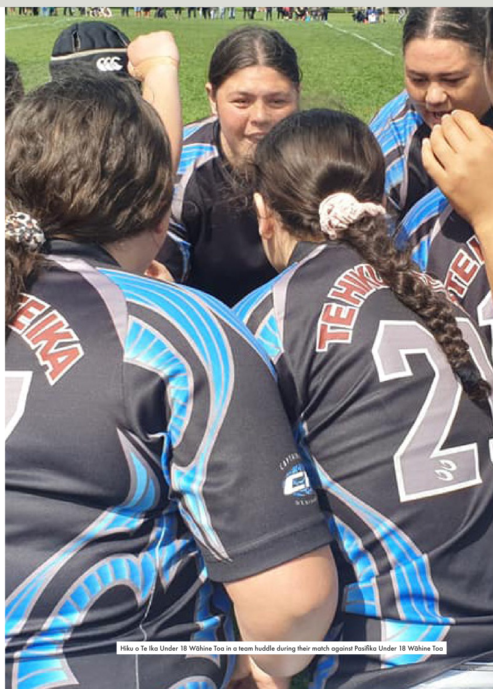
Hiku o Te Ika Under 18 Wāhine Toa in a team huddle during their match against Pasifika Under 18 Wāhine Toa