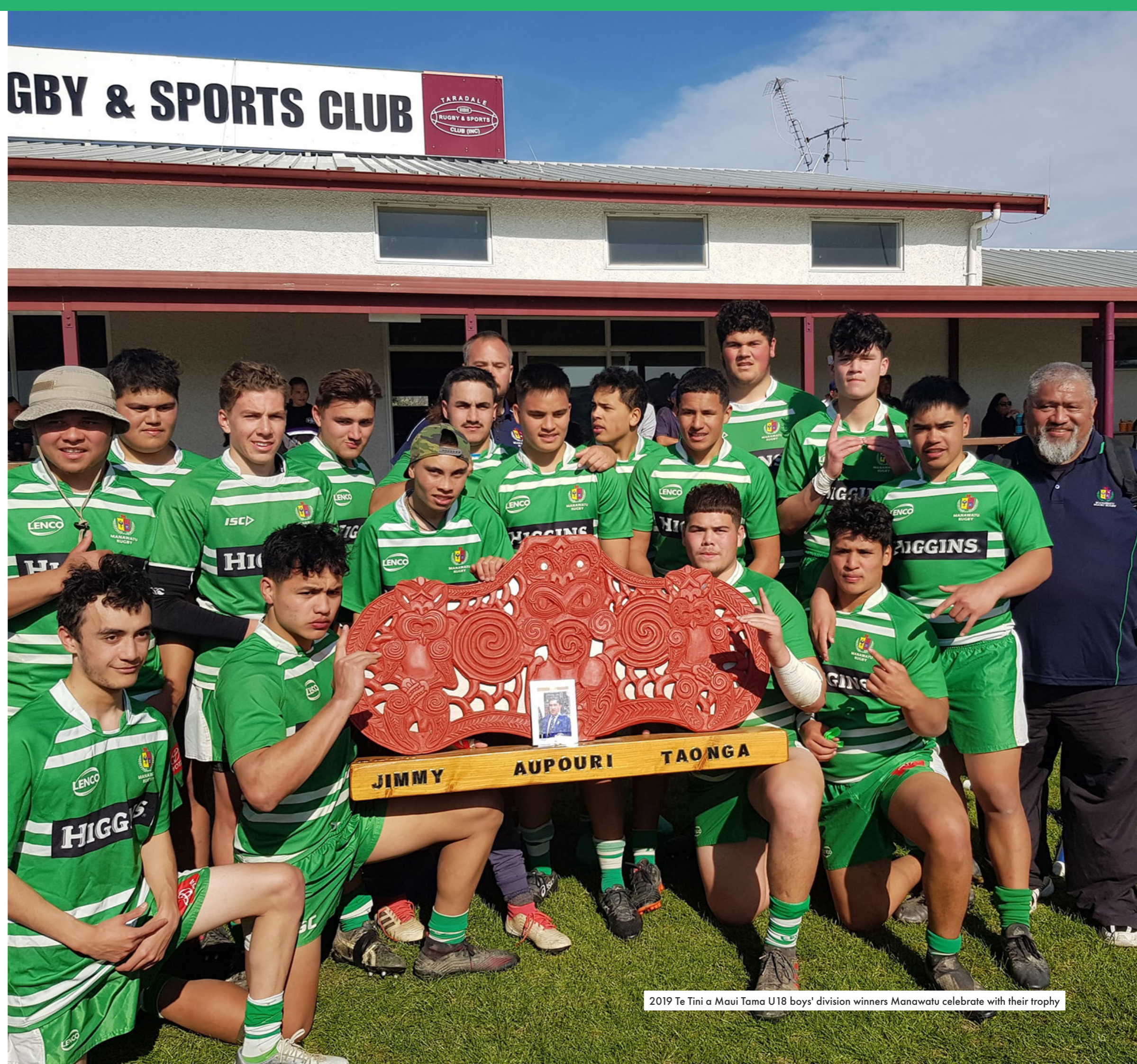
2019 Te Tini a Maui Tama U18 boys' division winners Manawatu celebrate with their trophy