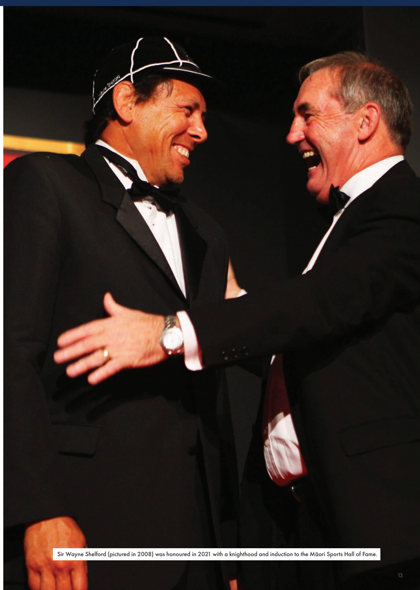
Sir Wayne Sheldford (pictured in 2008) was honoured in 2021 with a knighthood and induction to the Māori Sports Hall of Fame.