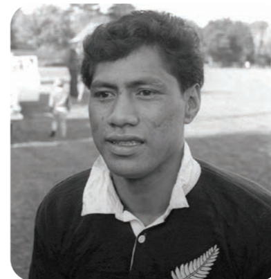
Waka Nathan (Ngāpuhi, Te Roroa, Waikato Tainui) All Black #627 24 September 2021, aged 81