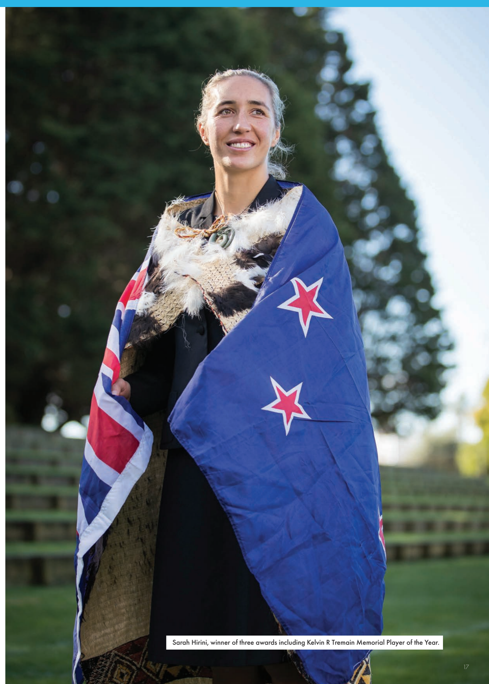
Sarah Hirini, winner of three awards including Kelvin R Tremain Memorial Player of the Year.

"Tahianga te tūpuna, tahianga te iwi, tahianga te tangata e tū nei, tī hei Mauri Ora!!"