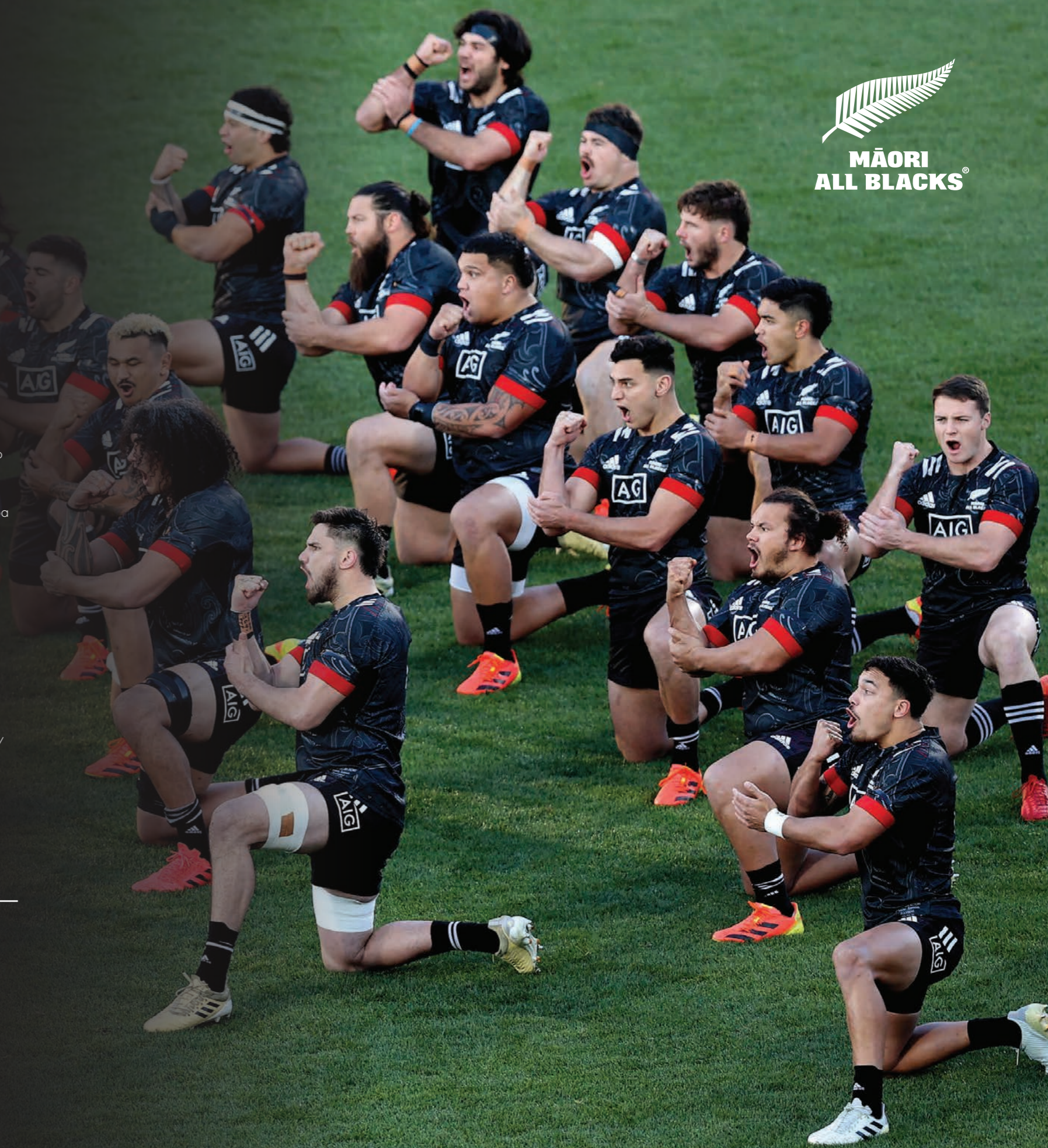
Māori All Blacks perform the haka at Mt Smart Stadium on 3 July 2021 in Auckland.