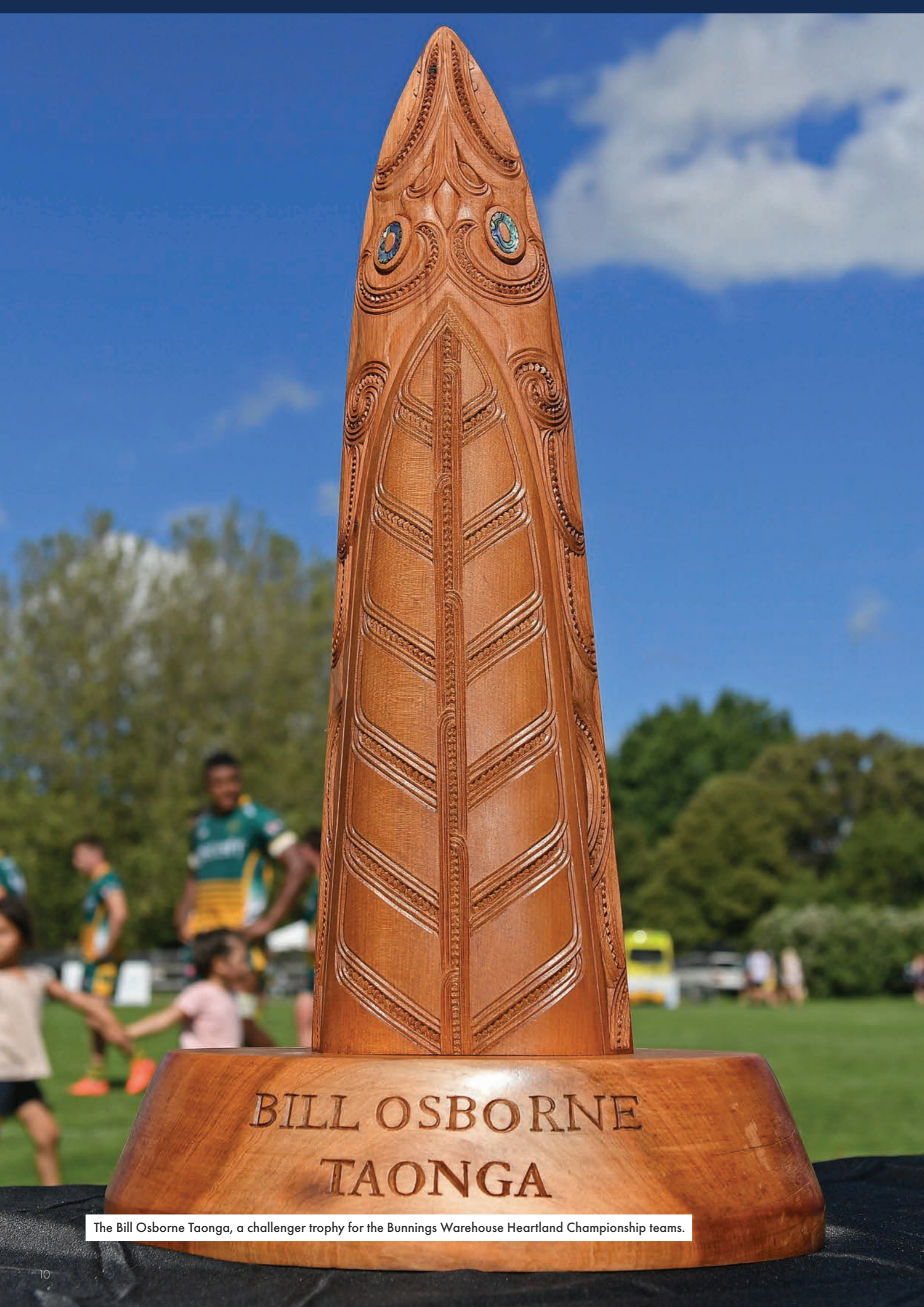
The Bill Osborne Taonga, a challenger trophy for the Bunnings Warehouse Heartland Championship teams.

E mihi ana ki a rāua mō ā rāua mahi me NZR e tuku nei ki ā mātau kaiuru tētahi pae tata hei whakahihiko tonu i te wairua i ēnei wā pōkaikaha. I a mātau hoki ngā pūtea hei whakatū i tētahi ki te tūranga Kaiwhakahaere Kaupapa Whutupōro Māori ki NZR, ā, ka whakakīia tēnei tūranga hei te tau 2022. Kei te pakari haere tō mātau waka whutupōro Māori, ā, ka taea e mātau te whakateri i ngā wai tuarangeranga nā te tautoko mai a Adidas, Steinlager, me AIG, kua noho hei tino kaitautoko i a mātau i te tau 2012 ki te tau 2021. E maioha atu nei hoki mātau ki te tautoko mai a Te Puni Kōkiri (mō te kaupapa Rangatahi Resilience), NZTE (mō te rautaki me te tono uara), me Deloitte (mō te whakahaere wānanga rautaki).