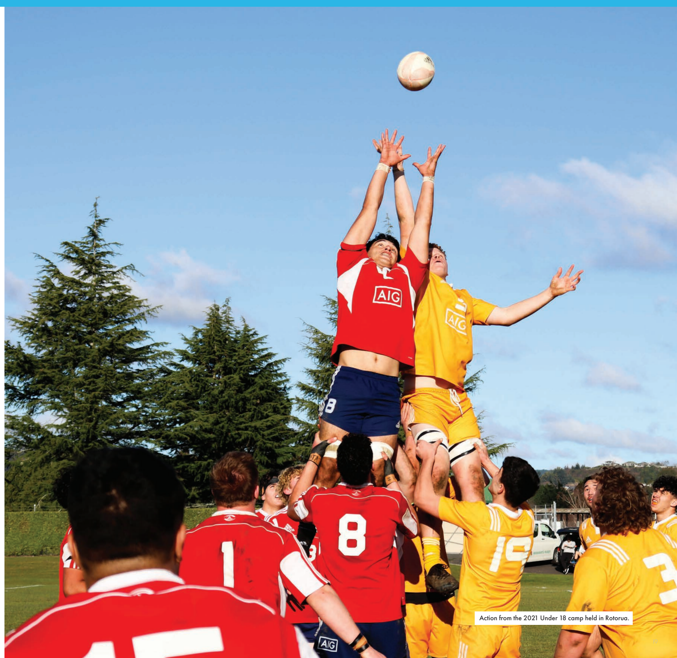
Action from the 2021 Under 18 camp held in Rotorua.