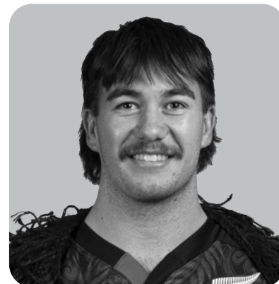
Connor Garden-Bachop Māori All Black, Highlander 17 June 2024