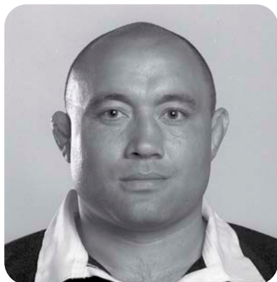
Norm Hewitt All Black #938, Māori All Black 16 July 2024