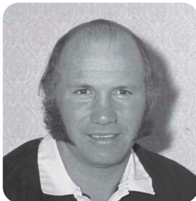
Sid Going All Black #655, Māori All Black 17 May 2024